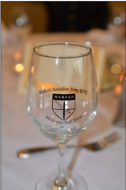
A commemorative wine glass was gifted to each attending couple.

After the seniors were introduced and toasts were given to the President of the United States and other important figures dinner was served. Dinner was followed by entertainment in the form of skits performed by various cadets poking fun at habits and quirks of the senior members in the Battalion and Cadre (instructors). The Cadets were then dismissed to remove some of their formal attire and commence dancing.