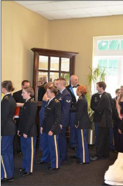
The Ball started with a receiving line in which attendees met and shook hands with members of the head table.