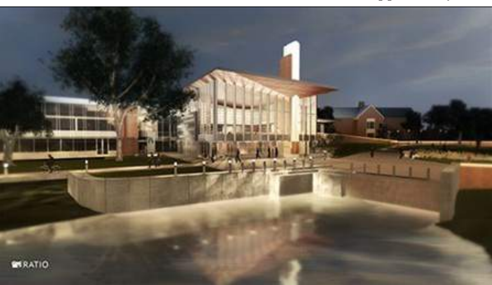
The future design of the Hulman Memorial Student Union.