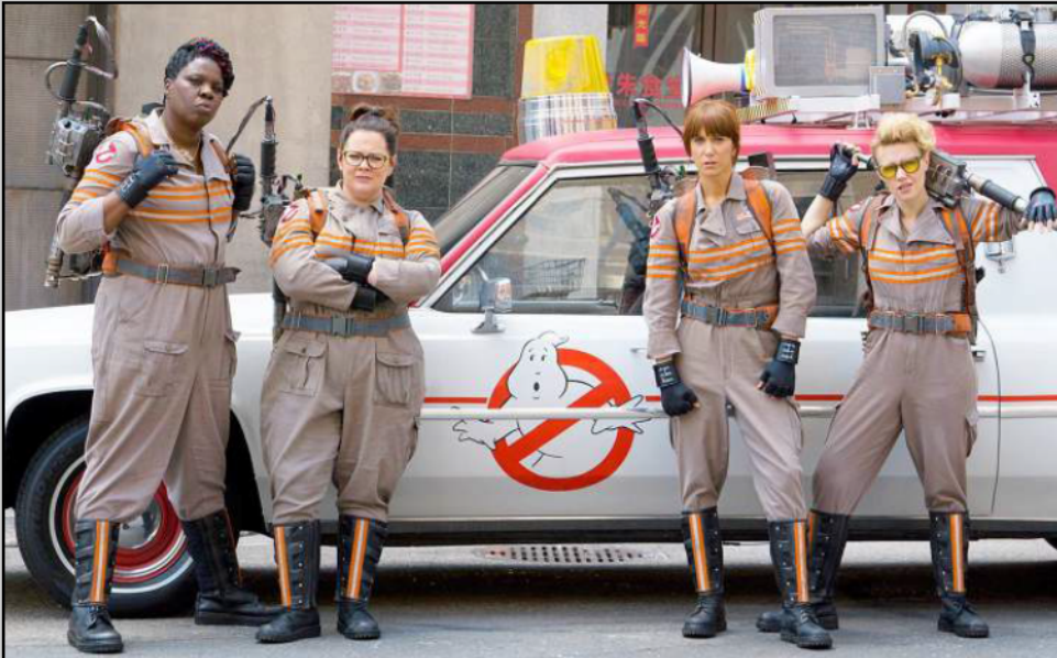
Ghostbusters (2016): a prime example of a shoddy reboot.

either. Meanwhile, "Nosferatu" is returning to movie screens here pretty soon. The only cinematic version of this film is the silent version from 1922, originally directed by F.W. Murnau. As it approaches its centennial...yeah, I guess it's allowed a remake. Especially when notable creature actor Doug Jones is going to be the titular character. If anyone can recapture the unnerving, chilling aura of Max Schrek's Dracula interpretation, it's Jones.