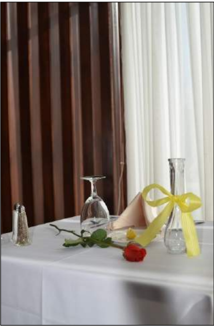
At every military formal event a symbolic table is set for the Missing In Action (MIA), Prisoners of War (POW), and fallen soldiers.