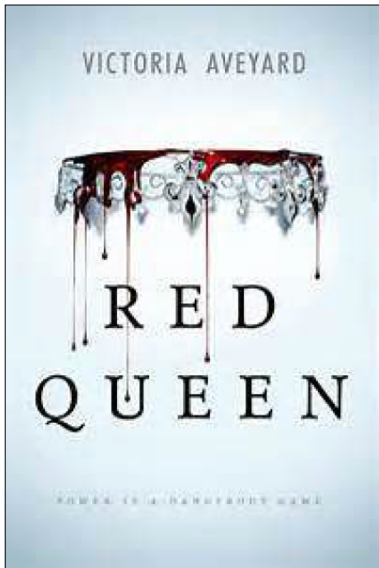
The Sanguine Dystopia.

Both classes are affected by an ongoing conflict over land belonging to people in the silver class. Even though it is the silvers' war, it is mainly red's blood that is spilt for the cause as reds are conscripted at the age of 18 to fight. This war has affected Mare's family greatly as her father's injuries made him unable to work and her two brothers are away at war. The only way to avoid conscription is to obtain an apprenticeship, which are few and far between. As Mare has attended school sparingly throughout her youth she accepts conscription as her inevitable fate. She spends her time out of