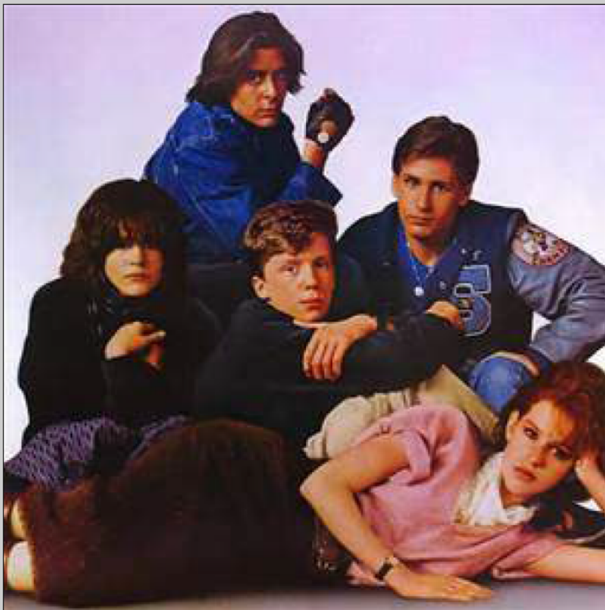
Basket Case, Criminal, Athlete, Princess, and Brain.

My second stumbling block was the concept that these students were even friends by the end of the detention. They spend the first half of the film piling on Title IX infractions (it takes more than thirteen years to figure it out I suppose), verbally sniping each other, and generally setting themselves to be a threatening move away from a bloodbath, yet one cooperative plan to acquire soda for lunch later and they are ready to sneak around the school in the name of cannabis. I suppose this helped facilitate the impromptu dance number and group therapy sessions, but the character's motivations seem pretty solidly set on "Well, I have nothing better to do." Moral of the story? Consume narcotics with the cool kids and you too can tell us how parental pressure pushed you to assault/attempt suicide/cut classes (all infractions are equal here in 80s suburban Chicago.)