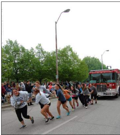
A team of Indiana State University Students pulling a Terre Haute Fire Department Engine.