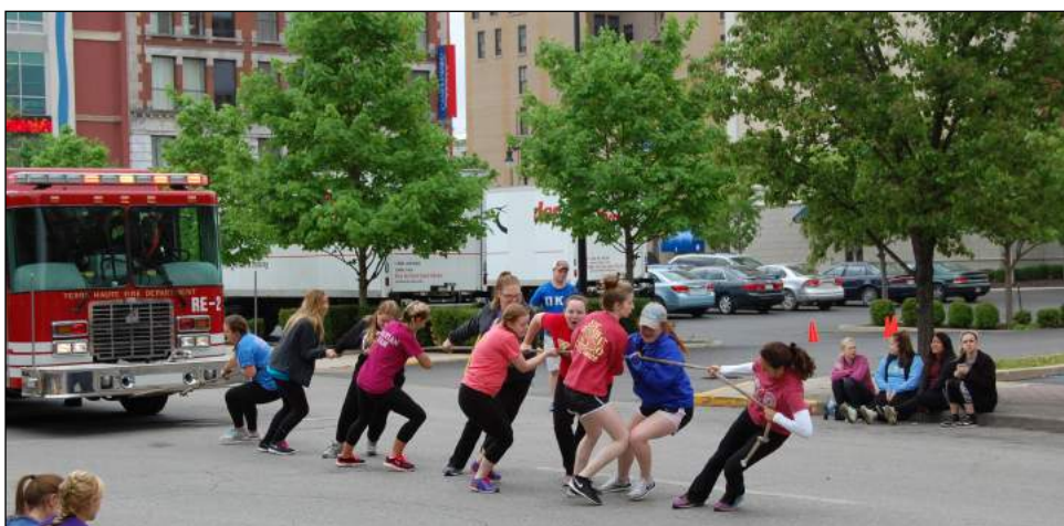
Students from both Rose-Hulman Institute of Technology and Indiana State University participated in Pi Kappa Alpha's Firetruck Pull.