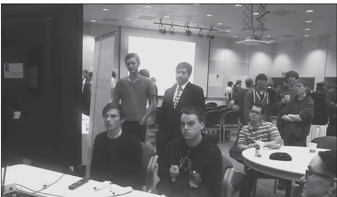
Students participating in the Super Smash Bros Tournament last week.