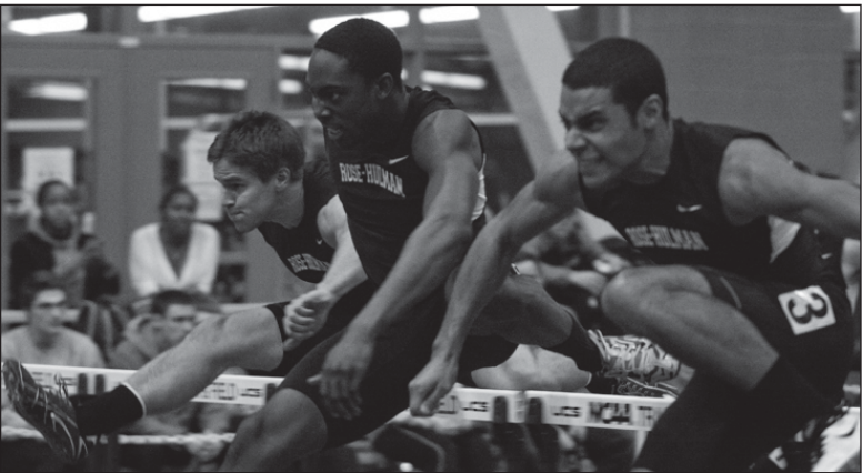
The men's track and field team was unanimously picked by the HCAC to claim a fourth straight indoor championship title.

would finish second overall. Rose-Hulman will be host of the Friday Night Invitational this weekend as they face eight teams from around the Midwest. The event will begin at 6 p.m. in the SRC with representatives from Carroll College, Franklin College, Hanover College, Earlham College, Brescia University, Mount St. Joseph, Kentucky Wesleyan University, and Wabash College all in attendance.