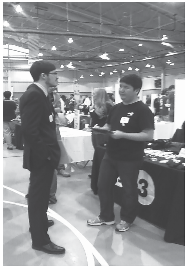
Rose-Hulman students speaking with a company during the Winter Career Fair this past Wednesday

The day of the Career Fair is one of my favorite times of the school year. This is a day to meet with new people, create contacts, and gain direction toward your life goals in whatever degree you desire to obtain. Sitting in your room alone will not help your situation later on in life. Instead, take your life by the reins and make sure that you give yourself the biggest boost possible for your future career. Others believe that as a freshman and a sophomore, you are unlikely to get an internship unless you have a spotless grade point average. This is a fallacy spread by those staying in their rooms instead of speaking to those at such events. In fact, the statement that public skills are not necessary goes hand-in-hand with the former. Good speaking skills are paramount in a field where your work will need detailed explanation to clients and everyday consumers. As many professors have pointed out, a single mistake in engineering can cost a life, which is priceless. This ability to communicate can then be used with potential employers to decide whether your skills are a good fit for the company in question. Without that, no amount of skill at school will carry you through into the real world with real life stakes. Take a chance by stepping outside of your comfort zone. You never know what you may find by just talking to a new person, whether at the Career Fair or in a local area. You might find your future career.