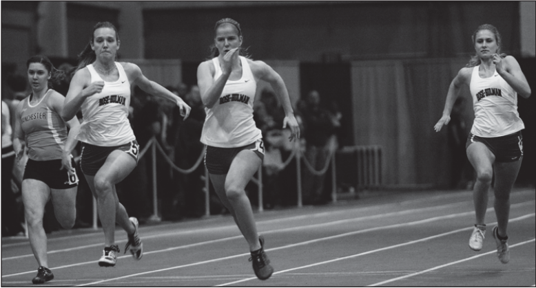
Five of fourteen events were won by the women's track and field team at the Terre Haute Double Dual Meet.

The 2014 indoor track and field season kicked off their season this past week-