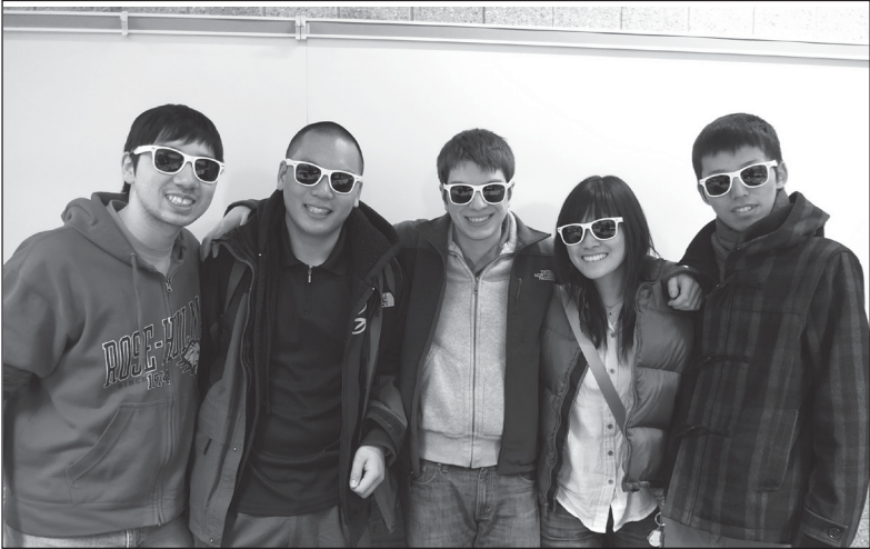
Many students volunteered to teach their native language to others who were interested in learning a new one.