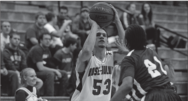
Rose-Hulman looks to return to their winning ways with the Alumni Day game at 3 p.m. Saturday against Transylvania University.

overall with a 7-2 conference record. The fight at the top of the conference continues as four teams are currently at 7 - 2. The next competition for the Fightin' Engineers will be this Saturday as they host Transylvania University. Tipoff is scheduled for 3 p.m. The matchup will be part of the annual Alumni Day events. Roughly two dozen former players will be in attendance and will take part in an alumni game that will follow the men's game. Rose-Hulman won a tight defensive contest against Transylvania last season 52 - 49. On Wednesday, they will face Anderson University starting at 7:30 pm in the Hulbert Arena.