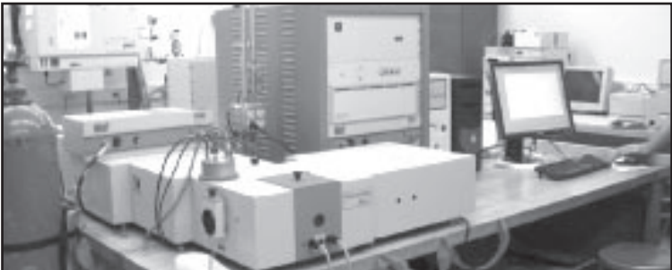
Jim Sedoff/ Rose Thorn The new fluorometer was officially dedicated Thursday.

of ultraviolet and visible light which can be used to [measure different molecules’ fluorescence].” Georgas explained that the fluorometer has been getting its share of work since setting foot on campus: “Currently we are using the instrument to measure the fluorescence of the human estrogen receptor’s fluorescence when it is bound to Tamoxifen. Because the protein’s fluorescence decreases when Tamoxifen is bound to it, we can measure how much is actually bound.” “Not that many universities have this good of a fluorometer. This is a big accomplishment for the chemistry department at Rose-Hulman. It sets us apart from many universities,” said Georgas.