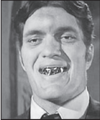
www.hot.ee Jaws from the 007 films.

If you missed the generation-defining series that was Flavor of Love, I suggest that you go find some episodes or clips on the net and check it out.