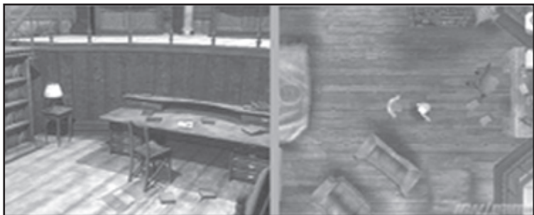
http://www.armchairempire.com/images/Reviews/ds/trace-memory Trace Memory utilizes both screens using the top screen for Myst like still shots (left), and the bottom for game action (right).

In order to avoid ruining the game, I'll just tell you that Ashley ends up running around the island in the company of a spirit called 'D' who has haunted the island for the past 57 years after forgetting the circumstances of his life and death. Thus Ashley spends the game trying to solve the dual mysteries of D's life and death at the Edwards Mansion, while at the same time finding out what happened to her family 11 years ago. The two stories ultimately intertwine through the game's overlying theme of mem-