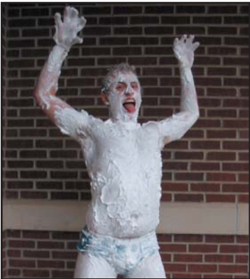
Another use for shaving cream: Abominable Snowmaaaan!

Send your prof quotes or other humor material to flipside@rose-hulman.edu