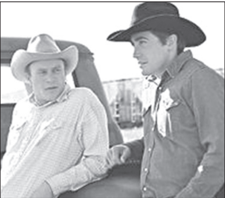
http://www.cbsnews.com/images/2005/12/12/imageNYET10312121846.jpg Brokeback Mountain was recently nominated for 8 Oscars, including Best Picture, Heath Ledger (left) for Best Actor, and Jake Gyllenhaal (right) for Best Supporting Actor.

“Brokeback Mountain? Isn't that the gay western porno?!”