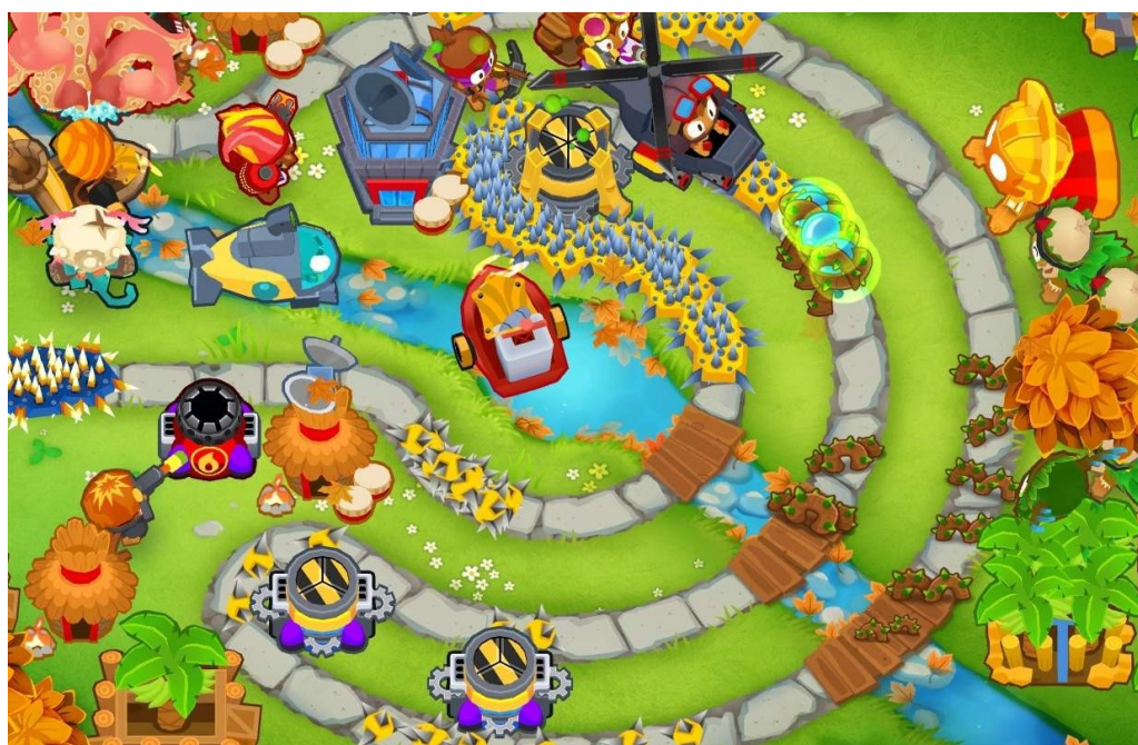
An example of a typical game of Bloons Tower Defense 6

your in-game bank account. Or maybe it's the super monkey, clad in tights, that shoots balls of plasma from his eyes at passing bloons. Whatever it