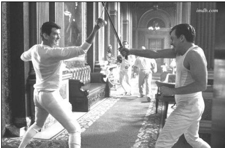
James Bond (Pierce Brosnan) and Gustav Graves (Toby Stephens) take up the sword in "Die Another Day."