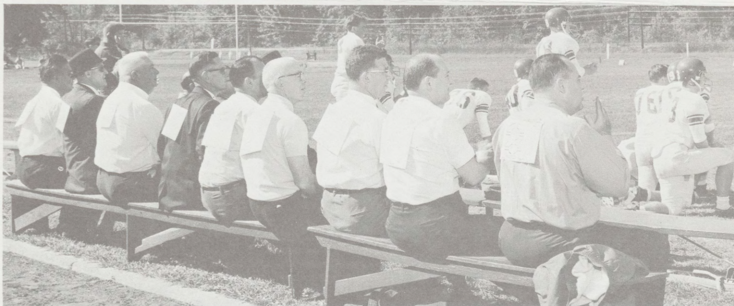
DAD'S DAY —Fathers of the football players were guests of honor at the Oct. 3 game. They had the best seats, wore their sons' numbers on their own shirts and were introduced to the crowd at half-time. To top it off, the boys put down Illinois College 13-7 for their first win of the season.