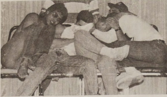
So who needs women at Rose?