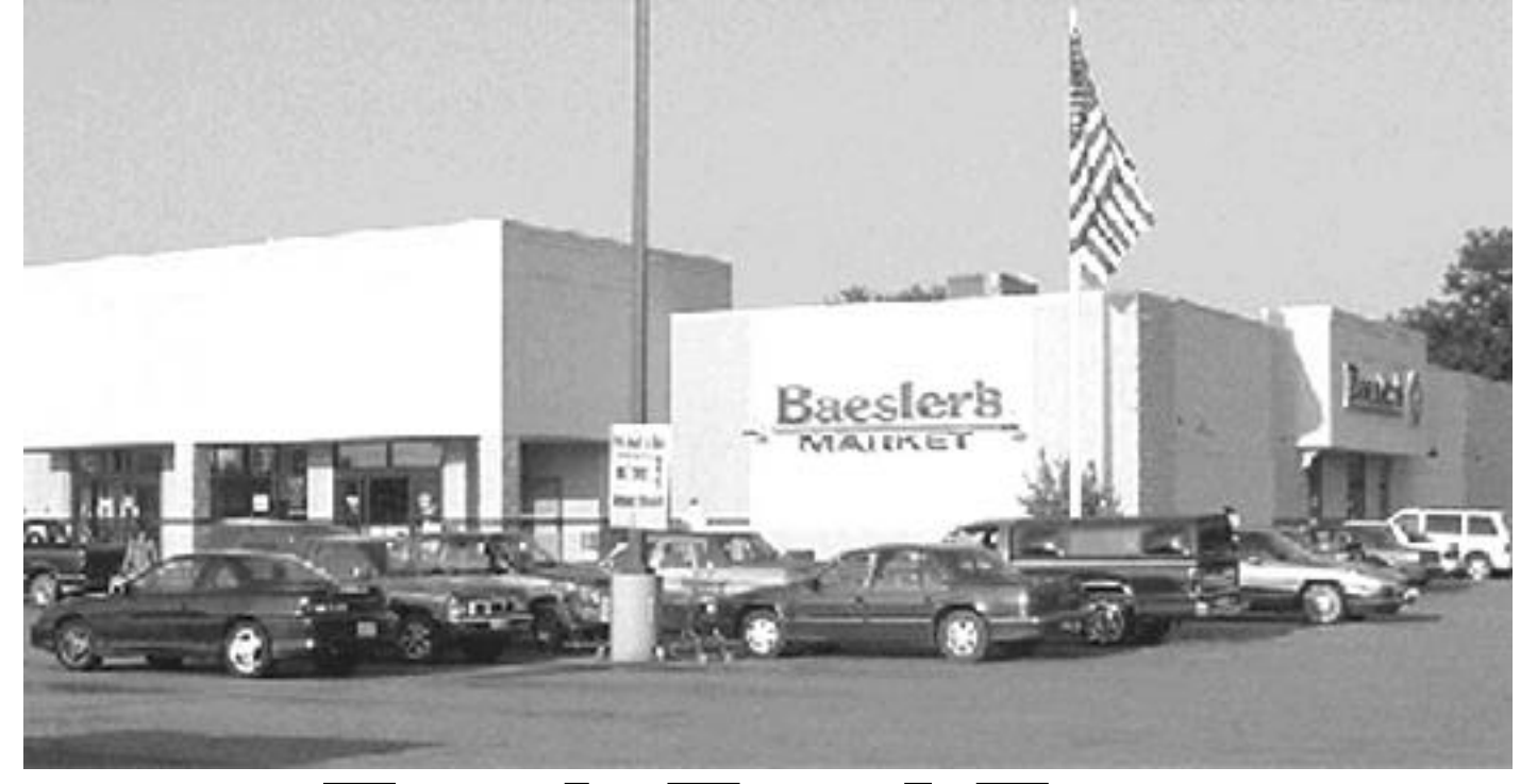
Fresh Food Fast High Quality Meat, Fresh Produce, Friendly Staff

Located at 2900 Poplar Street Behind the Meadows