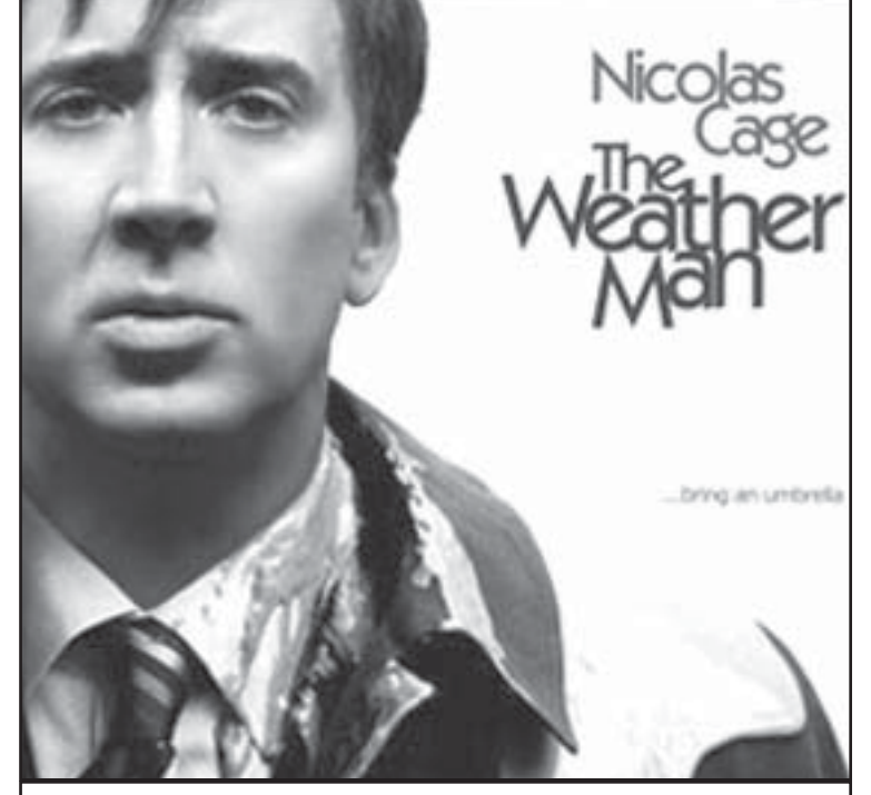
http://www.moviesonline.ca/movie-gallery/albums/userpics Fake snow had to be used while filming in Chicago, where it usually snows in February. So the weather was predicted wrong while filming a movie about a weather man. Weird.

Other than that there really isn't much plot to this movie. It's