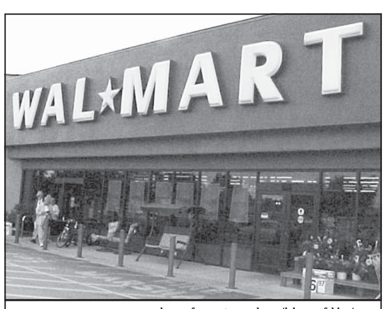
lawprofessors.typepad.com/laborprof_blog/news The only way to take down Wal-Mart is to destroy its heart.

Politically, it is also impossible to force change on a corporation with such powerful and far-reach-