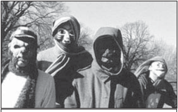
http://www.ohmyrockness.com/images/bands Animal Collective have seen a lot of critical praise in recent years.

Easily the best song is "Banshee Boat". Using the aforementioned repeating guitar chords for over almost 3 minutes, Animal Collective create the perfect mode for a rewarding crescendo. The 8-minute track delivers on its early promise, providing striking guitar lines and pace. Avey's vocals erupt similar to the close of "Did You See the Words?", but with even more power this time around. "Banshee Boat" shows that Tare is actually a very capable singer underneath the