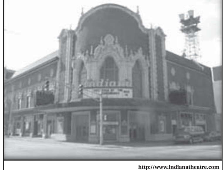
http://www.indianatheatre.com The Indiana theatre usually shows 2 or 3 second-run movies each

This theater was designed and built in 1922 by John Eberson, a renowned cinema architect in the early 20th century. It was styled in a Spanish Baroque motif and it showed the second I stepped into its entrance. I knew I was in for a treat. The entrance area is actually a high-ceiling rotunda, projecting an aura of old theaters in its glory days. One must be here