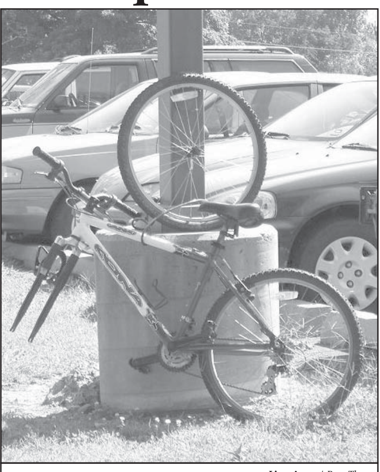
Lissa Avery / Rose Thorn This bike is periodically parked on a lampost between the Speed and Faculty parking lots.

I'm not advocating that we suddenly have bike racks galore, of course. We want to make sure we keep bike traffic off of the pedestrian sidewalks and pathways