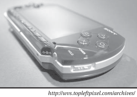
The PSP has had few good games released for it since its launch.

"Coded Arms," released within two weeks of "Dead to Rights," has the distinction of being the first and only true first-person shooter on the PSP. "Coded Arms" follows in the vein of "Doom,"