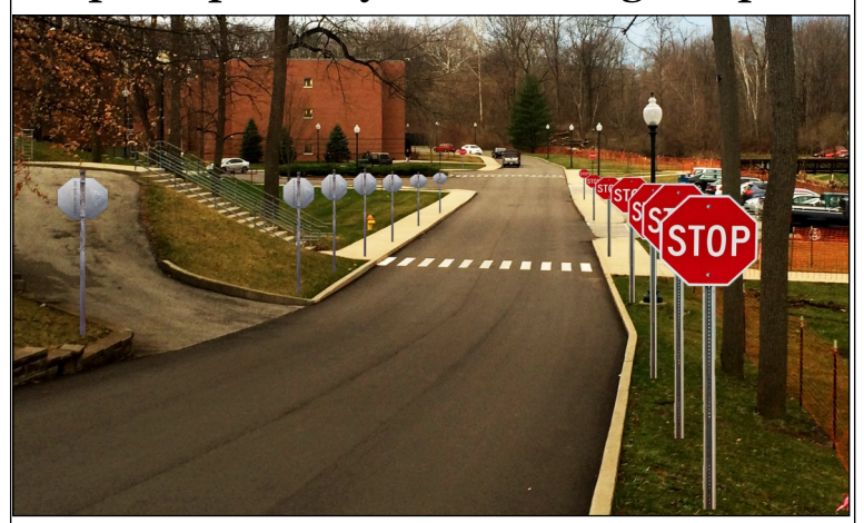
Pondshore residents have finally stopped driving to class.

"Effective immediately. Stop. Campus will have 50 more stop signs. Stop. Cross walks will have railroad gates. Stop. Stop what you are doing. Stop."