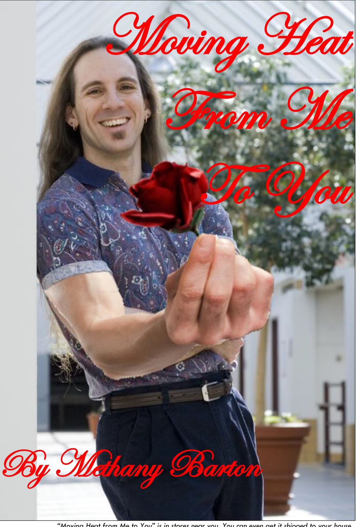
"Moving Heat from Me to You" is in stores near you. You can even get it shipped to your house. Secretly. Wrapped in brown paper with a label for adult diapers for discretion.