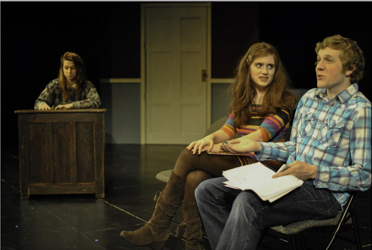
Students acting in one of the student directed plays.

Germany for the next quarter, and I would be visiting family around the country during break. It was strange to think that the play had brought us all together and after it was done