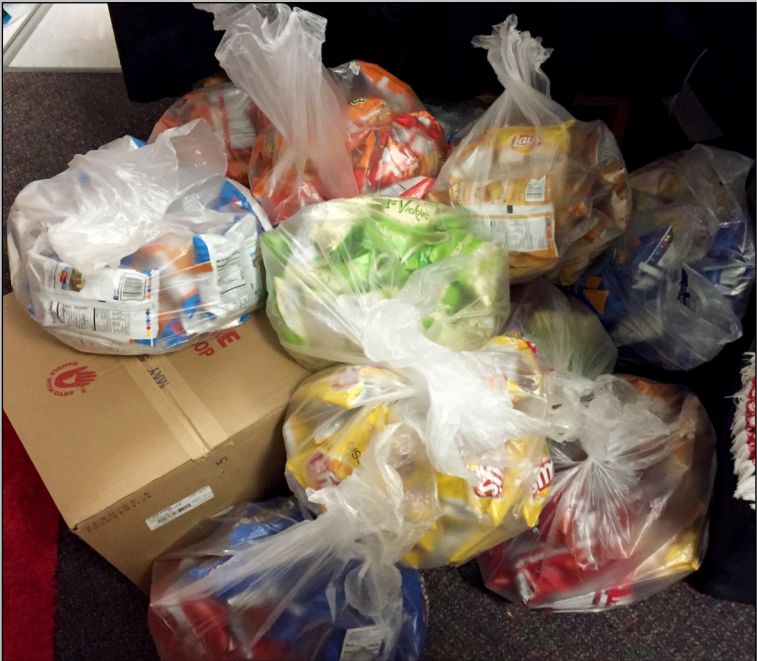
Over 350 bags of chips, which were bought at one time from Subway.

I live in the Apartments and have the 65/75 meal plan, the cheapest option, because each week my roommates and I go to