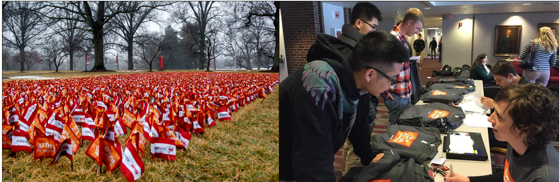
Symbolic flags planted near the entrance to Rose-Hulman representing all the alumni and people who donated to the institute. Students picking up their free t-shirts as a part of Attitude of Gratitude Week. Students are encouraged to wear the t-shirts to commemorate the week.