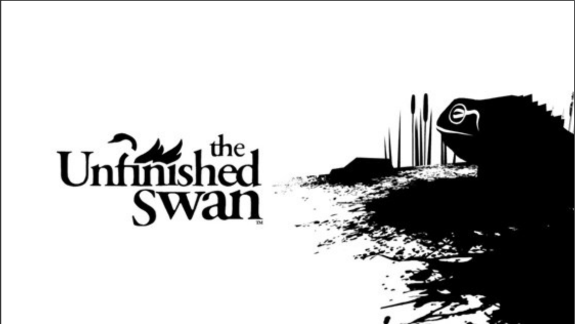
"The Unfinished Swan" sports a striking minimalist art style playstationgang.com

The Unfinished Swan is available on PlayStation 3, PlayStation 4,