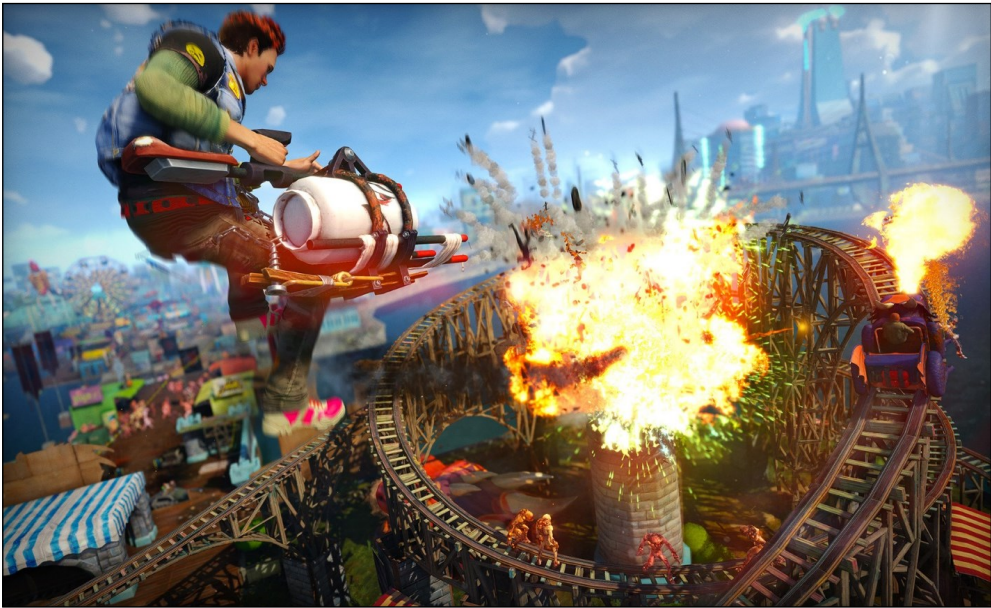
Giant showpieces and high explosives are a watermark of "Sunset Overdrive"

and attacks get more powerful. This is akin to something like "Tony Hawk Pro Skater," both in style of motion and special moves that require a full meter. The motion is incredibly fluid, and with practice you can combo all across the city without hitting the ground at all. The game breaks physics to keep the movement fun. You can run on water, for example. The sense of freedom in the world due to the movement is incredible.