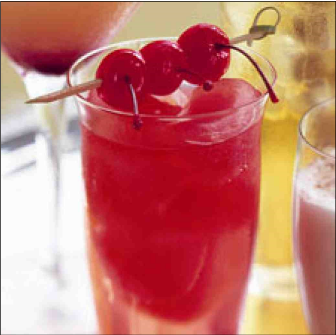
A nice cherry beverage is the perfect way to enjoy those spring days.

2 cups of water 1 litter lime citrus soda or seltzer 18 maraschino cherries Place the two cups of water in a sauce pan and bring it to a boil. Once the water is boiling, stir in the grenadine. When the grenadine is thoroughly mixed with the water, transfer the contents of the ice pan to two ice cube trays and place them in the fridge overnight. To serve, fill six glasses with the ice cubes and add the soda and maraschino cherries.